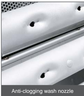
Anti-clogging wash nozzle