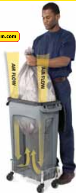
FG354060 shown with optional FG355300 Stainless Steel Dolly (see page 15).