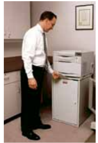
FG9W1700 with copier on top