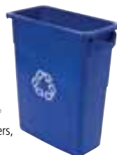
FG354173 For more Slim Jim® Recycling Containers, see page 85.