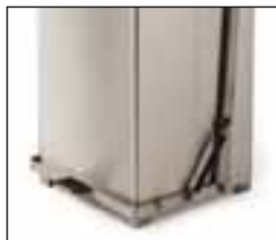
DAMPER CONTROLLED LID