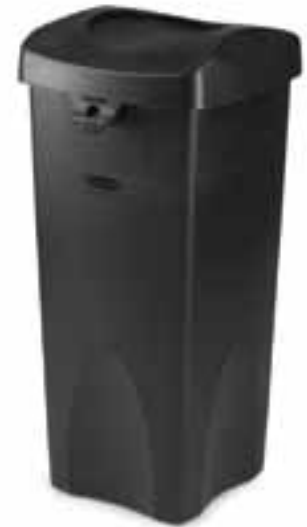
FG356988 / FG268988