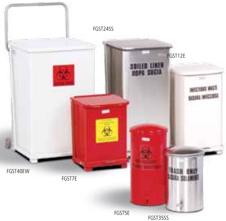
Shown with optional decals; see pg. 260 for decal options.