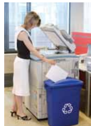
FG354173 with FG270388 lid