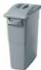
Slim Jim® Combo FG354220 See page 15 for ordering information.