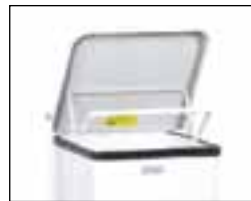
Folding retainer bands hold can liner neatly inside.