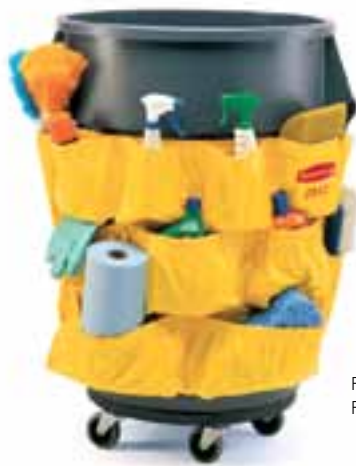
FG264300 / FG264200 / FG264000