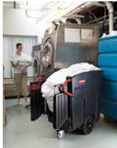
Rear doors allow easy content removal.