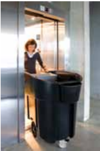
Fits through most doorways and elevators.

Large 12" wheels and 5" non-marking lockable casters in a diamond pattern allow Mega BRUTE® to turn on its own axis.