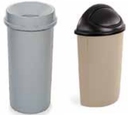
FG354800 / FG354600