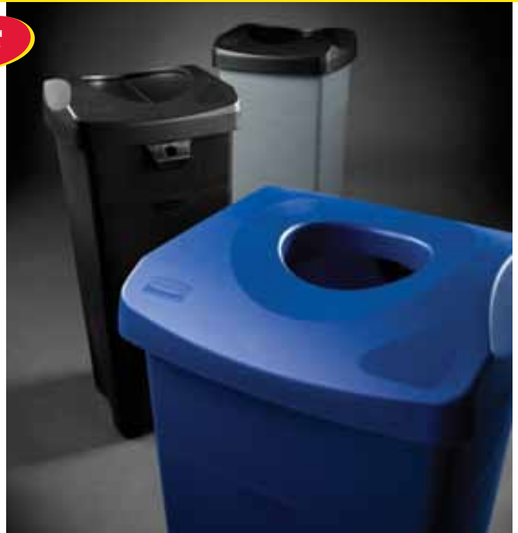
FG356988 / FG268988