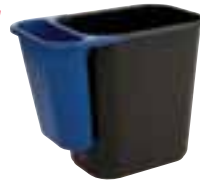
FG295073 / FG295600