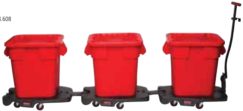
FG351700 / FG265103