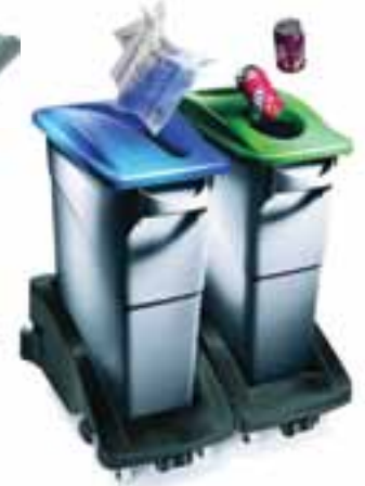
FG355188 with FG354220 / FG270388 / FG269288