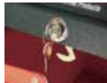
Includes locking mechanism.